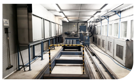
Thermal spray cabin